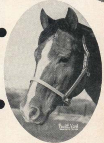
1957 STUD FEE $250 Thank You—Book Full