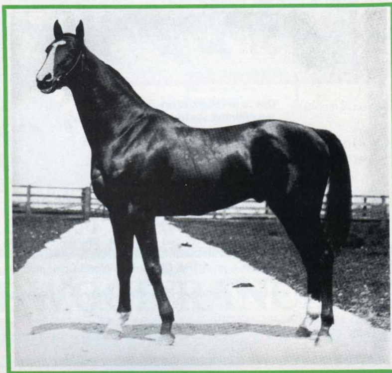
This rare photo shows Percentage (TB) in his prime, the proud winner of 19 races and $42,000 — and the sire of Three Bars (TB).

But Myrtle Dee had her colt by Percentage on April 8, only days after she was purchased, and her owners decided to name the colt...Three Bars. □